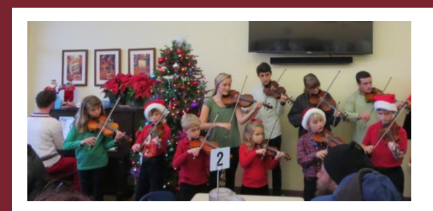
Triad Suzuki Fiddlers perform in Soup Kitchen.