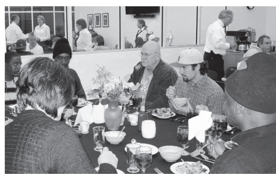
Food and fellowship at anniversary dinner