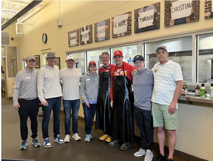
Volunteers from Centenary United Methodist Church

The game was competitive and exciting to watch but it did not compare to watching our guests smile, laugh, and connect. It was a moment we will cherish forever.