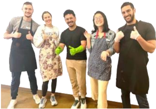
Photo Caption: Wake Forest University Medical Student Volunteers at Samaritan Ministries