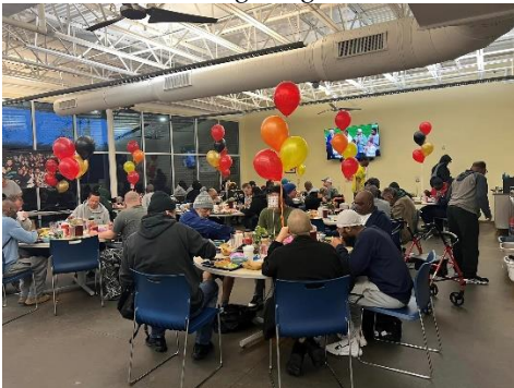
A dining room full of fun and brotherhood